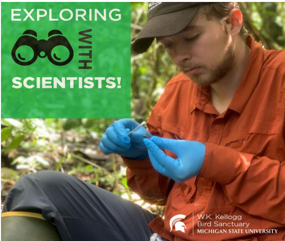
W.K. Kellogg Bird Sanctuary MICHIGAN STATE UNIVERSITY

April 2: How do microbes help plants grow?